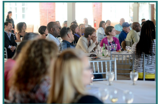
Guests listen intently during the LeChase presentation.